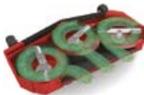
50/50 mulch and rear discharge